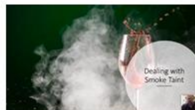
Webinar "Dealing with smoke taint"