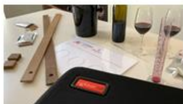
Nektar ID demo video