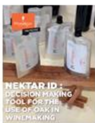
Nektar ID brochure